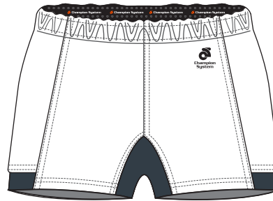
: Backt View :