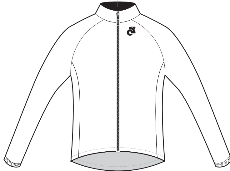
: Repel Jacket (RKJ015) : ( Full Printing ) ( Fleece Fabric inside Collar )