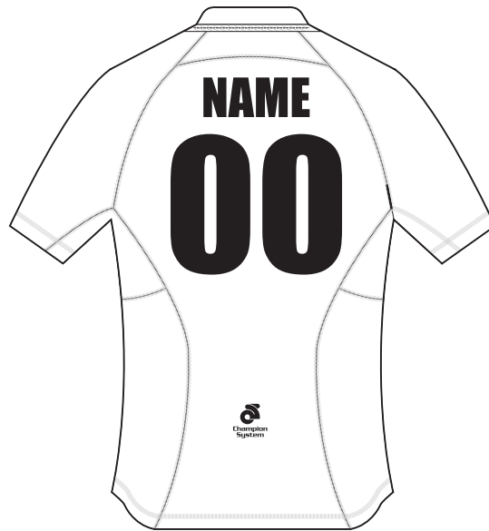
: Backt View :

: SHORT SLEEVES RUGBYJERSEY : ( MRU017 )